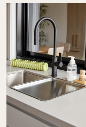
Products featured Laundry detergent and items by The Dirt Company Great Mate by Great Wrap Hand wash by Pleasant State Dish brush by Go for Zero